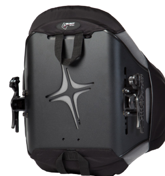
ROHO® AGILITY® Max Contour Back System