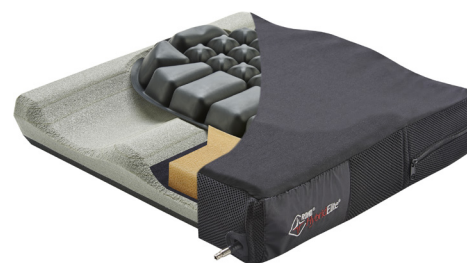
ROHO® Hybrid Elite® Cushion