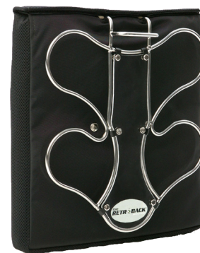
ROHO® RETROBACK® Back Support System

100 North Florida Avenue • Belleville, IL 62221-5429 • USA • roho.com U.S.: 1 800 851 3449 • 1 618 277 9173 • fax 1 888 551 3449 Outside the U.S.: 1 618 277 9150 • fax 1 618 277 6518