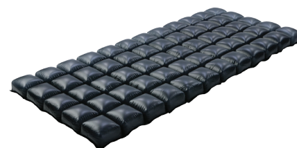
ROHO® PRODIGY® Mattress Overlay System