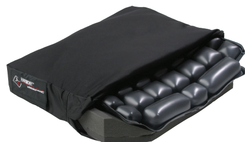
ROHO® HARMONY® Cushion