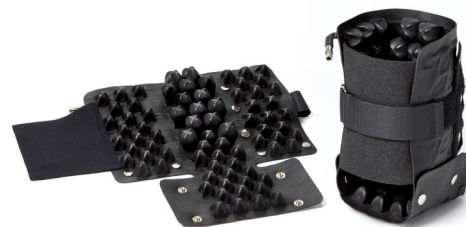
ROHO® HEAL PAD® Cushion

100 North Florida Avenue • Belleville, IL 62221-5429 • USA • roho.com U.S.: 1 800 851 3449 • 1 618 277 9173 • fax 1 888 551 3449 Outside the U.S.: 1 618 277 9150 • fax 1 618 277 6518