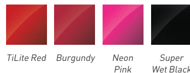
TiLite Red Burgundy Neon Pink Super Wet Black